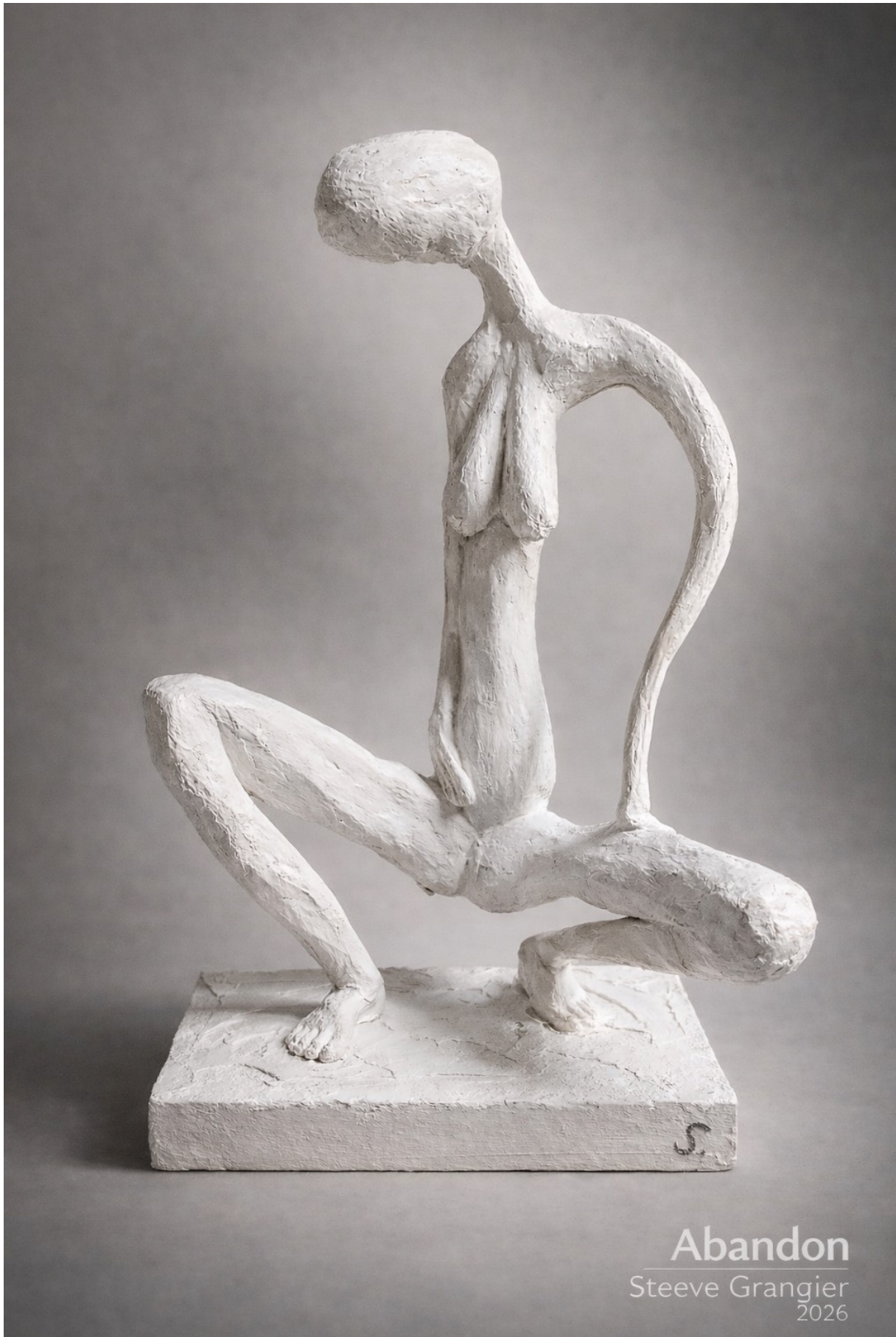
Abandon Steeve Grangier 2026

Wood Pulp Sculpture, 50 cm oil Paint with Expressive Impasto